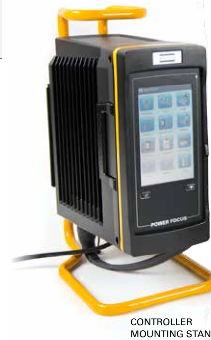
CONTROLLER MOUNTING STAND