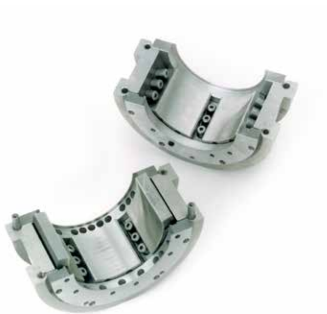
A horizontally-split bearing

When the findings suggest corrective measures are needed, we will gladly work with you to plan repairs, order parts, schedule maintenance, or implement other required responses.